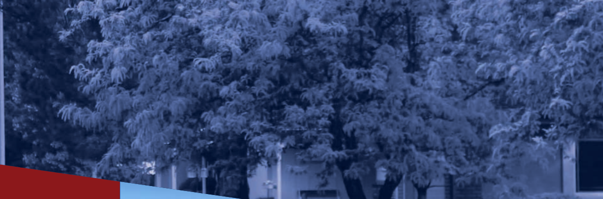
WIC serves an average of 400 families per month in Douglas County.